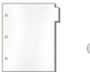
3 Hole Punched

Any other type of divider pages (commercially available, homemade or DIY) are not allowed: (see example below).